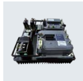
Advanced full-AC power system, full closed, compulsory air-cooled, reliable and safe