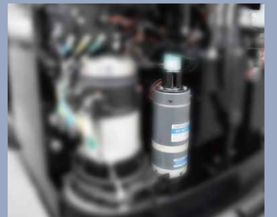
EPS (Electric Power Steering) is standard specification