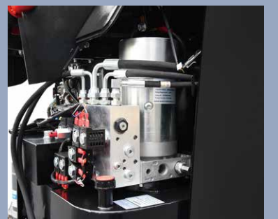
BUCHER hydraulic unit