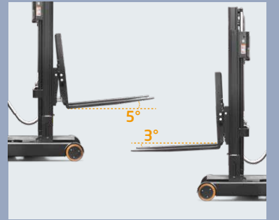
Fork tilt F/R: 3° / 5°