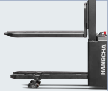
The pallet stacker with initial lift provides, higher efficiency and better passing ability