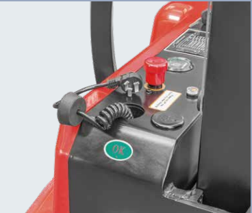
Built-in charger and maintenance free gel battery adopted to provide convenient usage