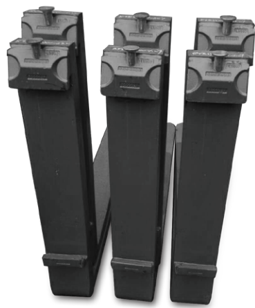
Higher specification fork mounting level-2B, more weight can be loaded.