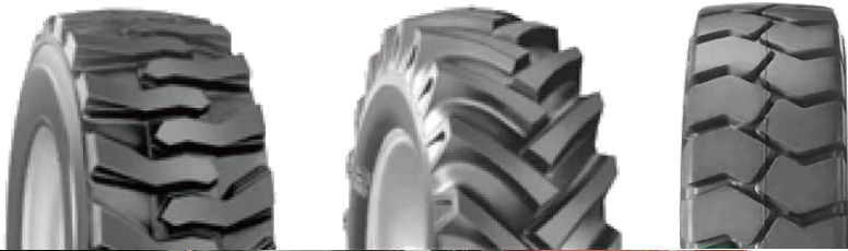
2WD Rear tyre:27x10-12