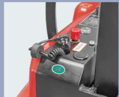
Built-in charger and maintenance free gel battery adopted to provide convenient usage