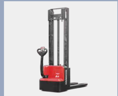
Optimized designing structure to offer a good visibility and easy entrance to the pallet