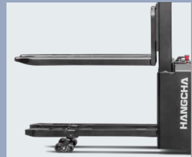
The pallet stacker with initial lift provides, higher efficiency and better passing ability