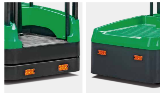
Front and rear flashing lights