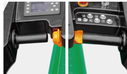
Right and left hand sensing