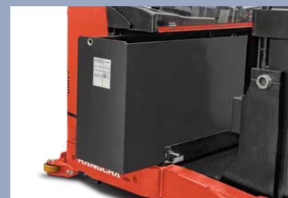
Battery side roll out