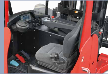
A perfect interface between operator and truck has been achieved with the HANGCHA ergonomic design concept