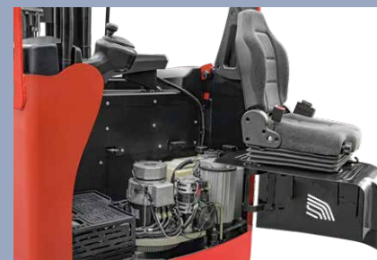
Fully open door enables easy repair and maintenance