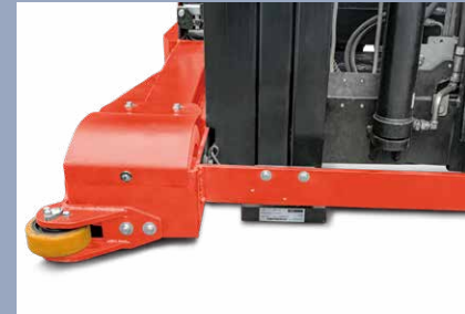
Rail or wire guidance