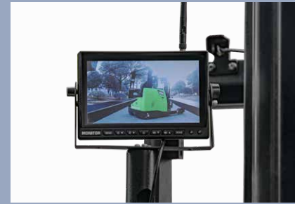
Camera systems for driving and pallet handling