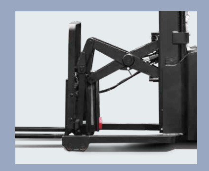
Forks move forward by the scissor structure