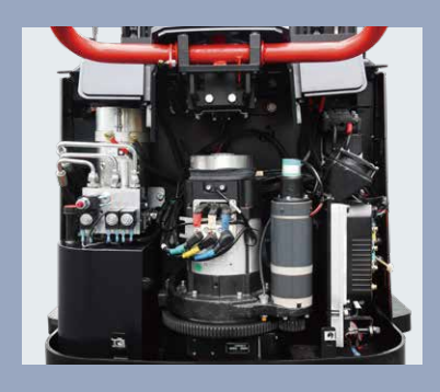
Back cover can be opened fully