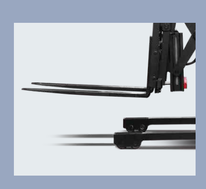
Proportional controlled forks can be operated more accurately