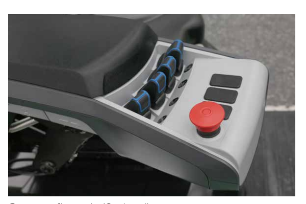
Grammer fingertip (Optional)

Silence, no pollution, energy saving and other advantages meet the environmental protection requirements.