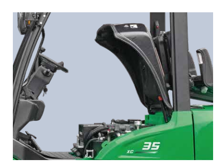
The hood can be opened at a large angle facilitating the maintenance.

Internal Components Protected with Fully-sealed Hood, controllers, motors electrical components, etc. are sealed from dust and water.