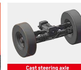
Cast steering axle

The steering axle is installed with rubber pad, which effectively improve the operation comfort and reliability.