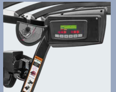
Easy to see display