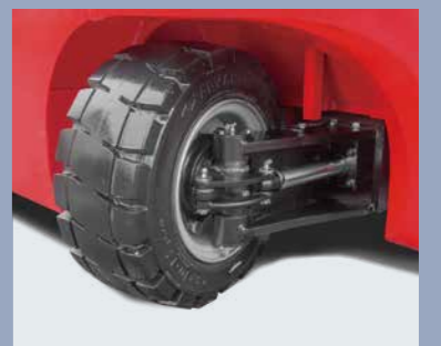
Smaller turning radius