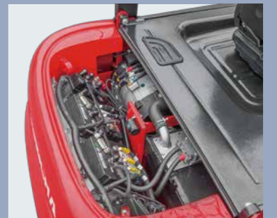
Easy for maintenance